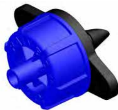
PC 4 L/h