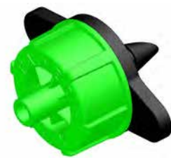
PC 8 L/h

EUROPLAST S.R.L. S COSTRUZIONE STAMPI INIEZIONE MATERIE PLASTICHE