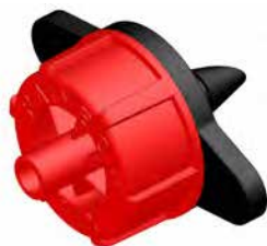
PC 2 L/h

Los GOTEROS INTERLINEA PC “Rainbow” son goteros autocompensantes munidos de un diafragma de silicona desmontable que regula el flujo de agua a diferentes niveles de presión. Producimos los Rainbow en tres versiones diferentes: 2 – 4 – 8 L/h. Su uso se recomienda en zonas de colinas y/o en suelos con diferentes niveles de inclinación.